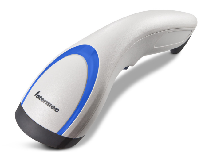
Designed to meet the needs of healthcare, the SG20 scanner helps you consistently meet patient safety standards.

The SG20 family includes the option of either a Bluetooth wireless or tethered (cabled) scanner, and a choice between